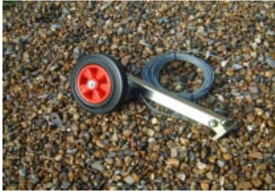
Under belt Tacho